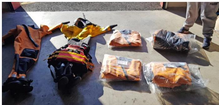
New Custom Made Safety Suits

The purchase of the 6 new custom-made safety suits allows the diving team to carry out searches with good quality and safe equipment. Having up to spec safety suits allows them to conduct their jobs with minimal risk to themselves and with the best equipment that meets health and safety requirements.