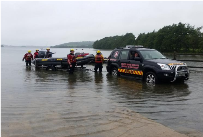
Getting ready to launch: Source- Meath River Rescue

this project they carried out fundraising on the ground by going collecting donations from different households in the area and by having church gate collections.